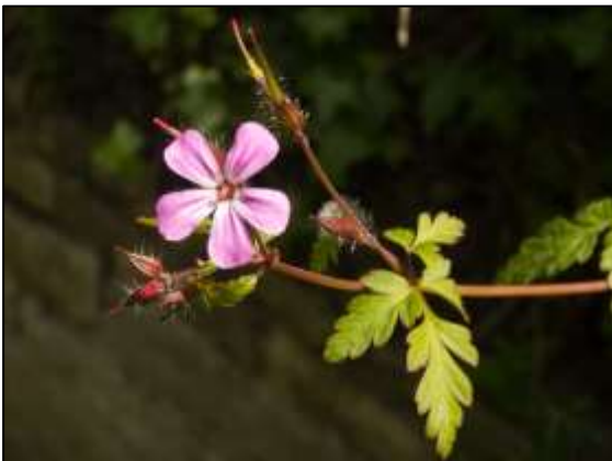
Photo 21 – Red Campion growing near base of Old Pit heapstead ramp (May 2015).