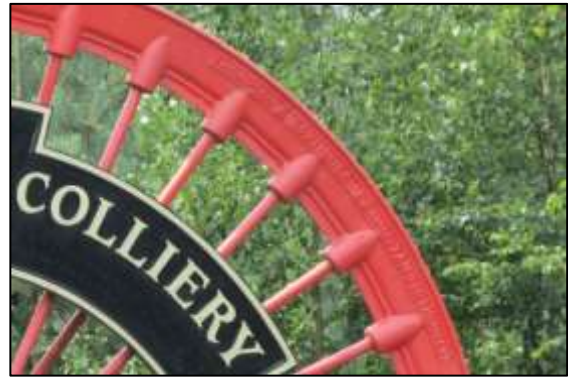
Photo 17 – Half winding wheel at entrance to Thorseby colliery, Nottinghamshire, showing the maker's name. (©T Rendall, July 2015)