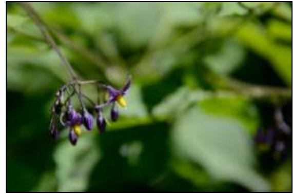
Photo 22 – Bittersweet, one of the Deadly Nightshade family, growing on the fence behind the storage container.