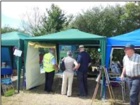
Photo 20 – Visitors are shown around the AIBT stand at the South Gloucestershire Show.