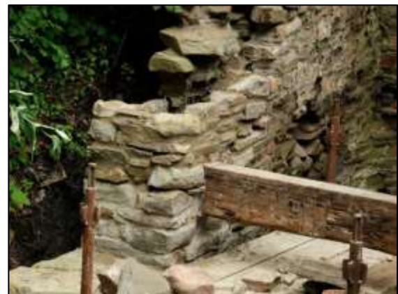
Photo 6 – The stone skin around the end of the bracing beam has been completed, and is ready to be filled with concrete.