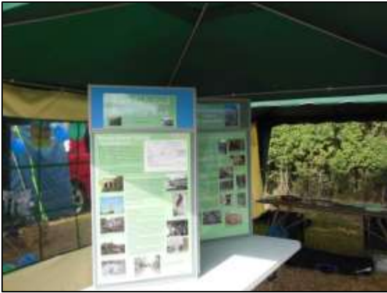
Photo 19 – Brandy Bottom display boards in the AIBT stand at the South Gloucestershire Show.