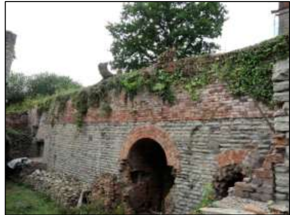
Photo 16 – ... and the same wall in August 2015 after it had been cut back.