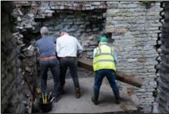
Photo 1 – Manhandling an old railway sleeper into place above the Pumping Shaft capping, where it will form part of the base for the patching of the heapstead wall.