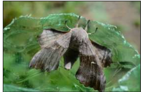
Photo 24 – This Poplar Hawk-moth, with an impressive wingspan of around 3", landed on a volunteer as he walked past.

Unless otherwise stated all photos are by Robin Whitworth (© 2015).