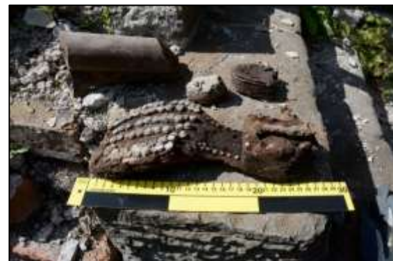
Photo 12 – Sole of hobnailed boot found in spoil in the winding drum pit, Vertical Engine House. (30 cm scale)