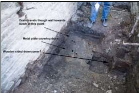
Photo 8 – View of the bottom of the winding drum pit in the Vertical Engine House on 03 June. The spike sticking out of the right hand margin of the photo may have held the wooden sides of the vertical channel in place.