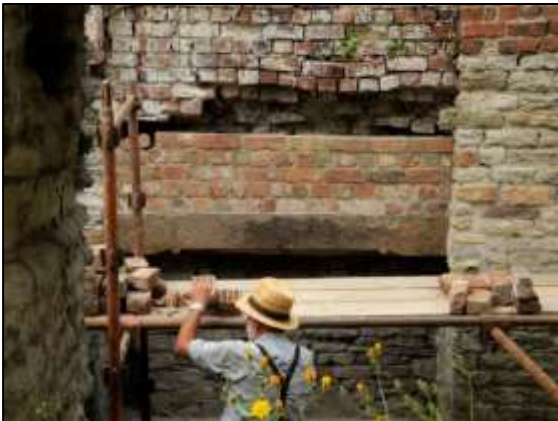
Photo 3 – Partially patched wall above the Pumping Shaft capping on 01 July.