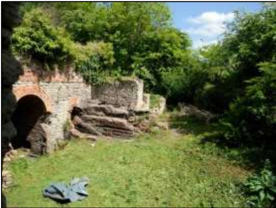
Photo 15 – The South-east wall of the Old Pit heapstead in May 2015, showing the vegetation growing along the top of the heapstead wall ...