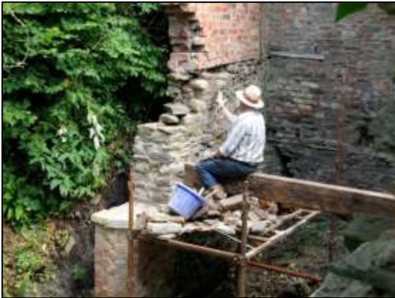
Photo 7 – Repointing some of the partly rebuilt north-east wall of the Old Boiler House.