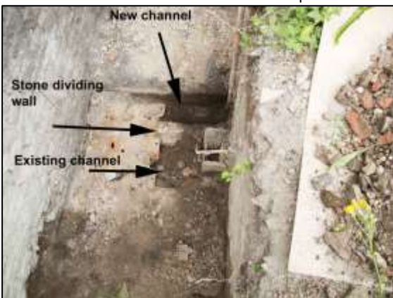
Photo 9 – View of the bottom of the winding drum pit on 01 July after the second channel was uncovered.