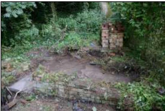
Photo 14 – Concrete floor of Fan Engine House partially cleared of spoil.