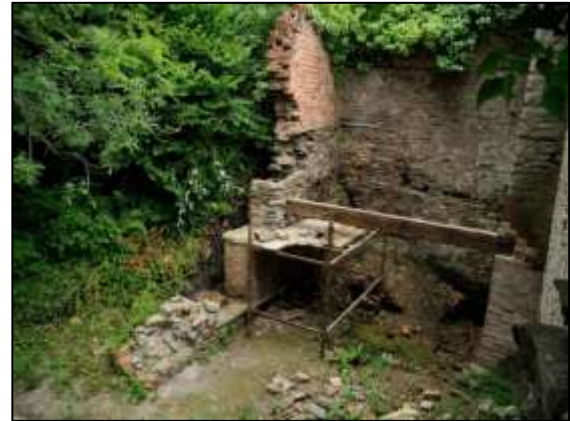
Photo 4 – The extent of unsupported brickwork in the north-east wall of the Old Boiler House can be seen at the middle top of the photo, which was taken in July.