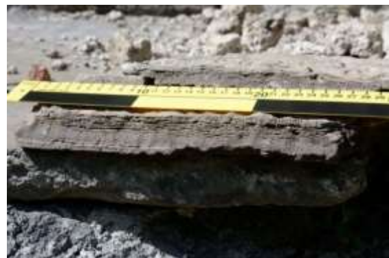
Photo 11 – View of the edge of a slab of scale recovered from the winding drum pit in the Vertical Engine House. This shows that it has been deposited in distinct layers. (30 cm scale)