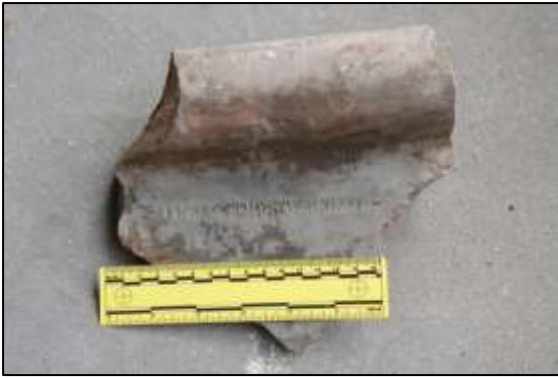
Photo 13 – This 7" long fragment of ridge tile, found in the spoil in the winding drum pit of the Vertical Engine House, has the maker's name "Browne & Co Bridgewater" indented into it. (15 cm scale)