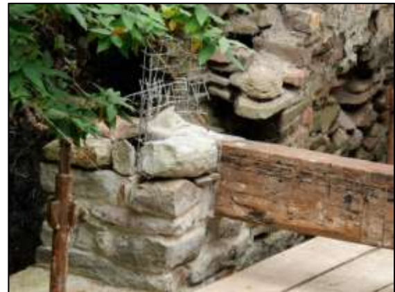
Photo 5 – An early stage in the rebuild of the north-east wall of the Old Boiler House. The bracing beam is in place, and the wire mesh reinforcement for the concrete pad can be seen around its end.