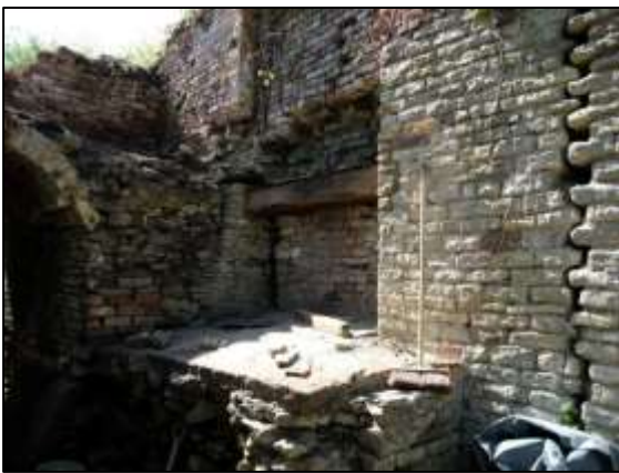
Photo 2 – The supporting beam, made from two old railway sleepers, in place above the Pumping Shaft capping.