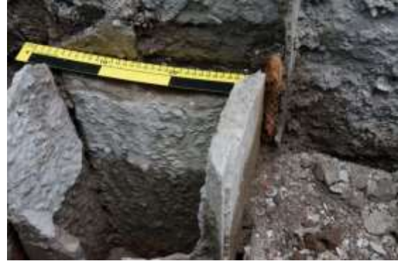
Photo 10 – Close-up of the scale deposited inside the channel in the winding drum pit. Fragments of the wood that formed the channel can be seen on the outside of the slab on the right. (30 cm scale)